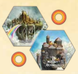
Asgard and Mount Olympus home base tiles and 2 markers used to track the home base health on the game board.