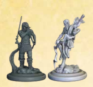
12 Norse god plastic minis 12 Greek god plastic minis